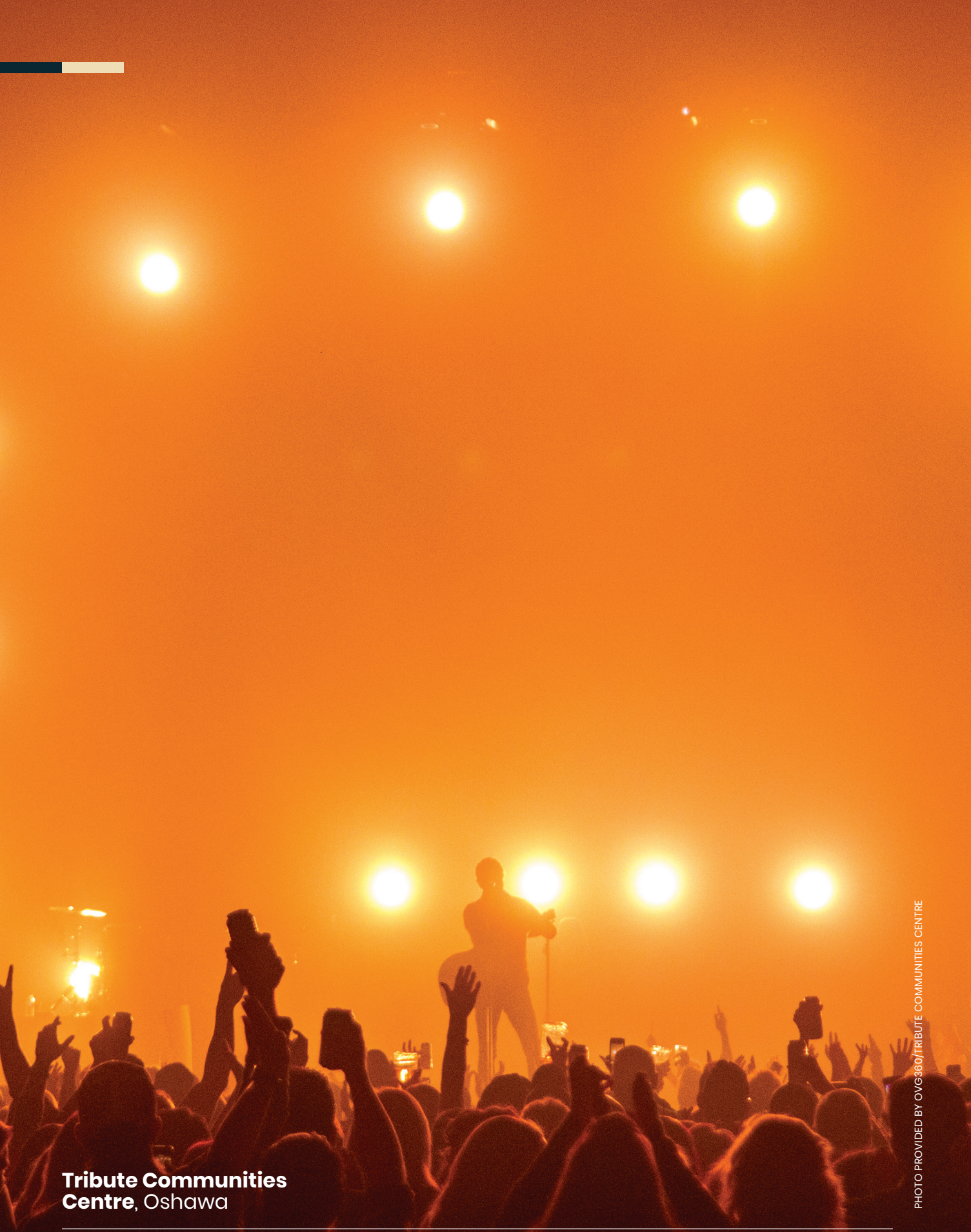
Tribute Communities Centre, Oshawa