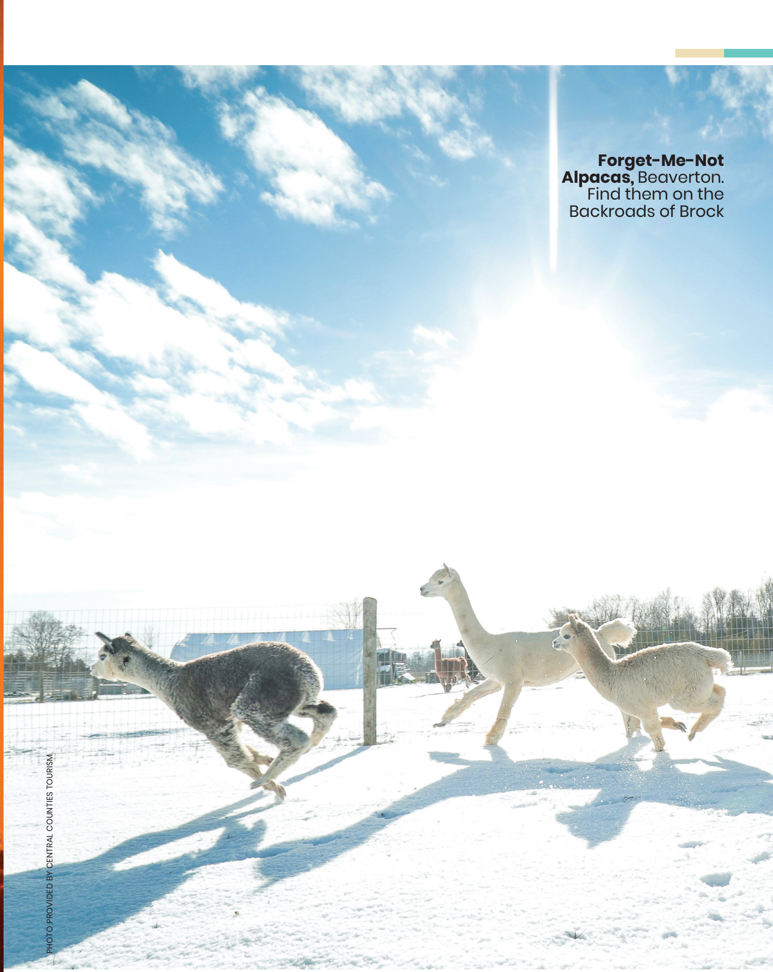
Forget-Me-Not Alpacas, Beaverton. Find them on the Backroads of Brock