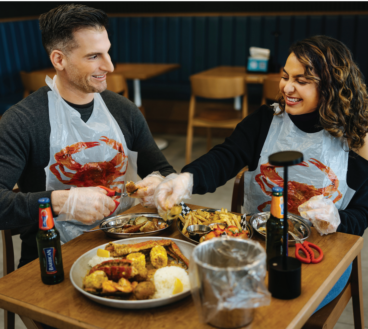
Sea Salt Seafood Cafe, Ajax