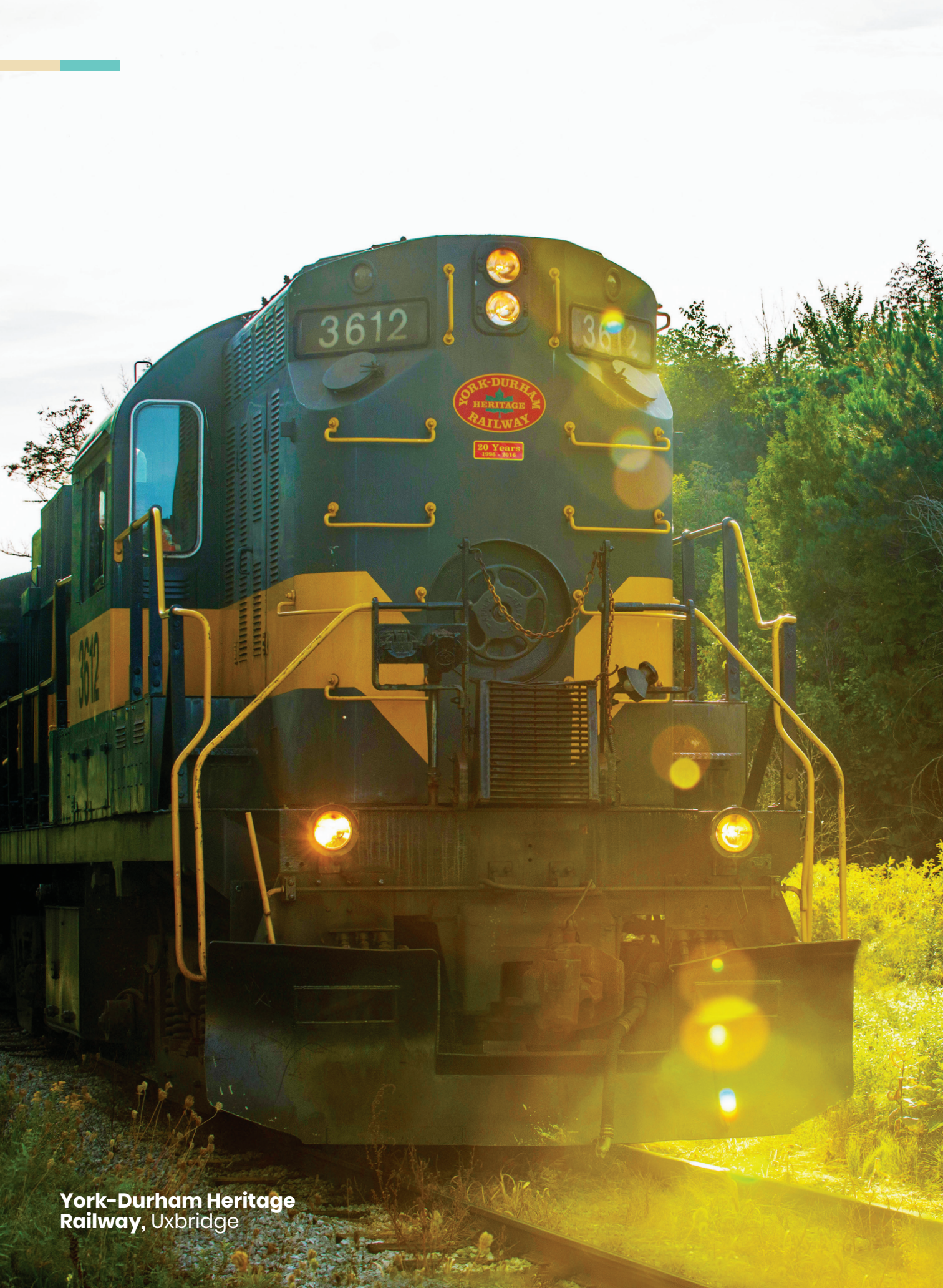
York-Durham Heritage Railway, Uxbridge