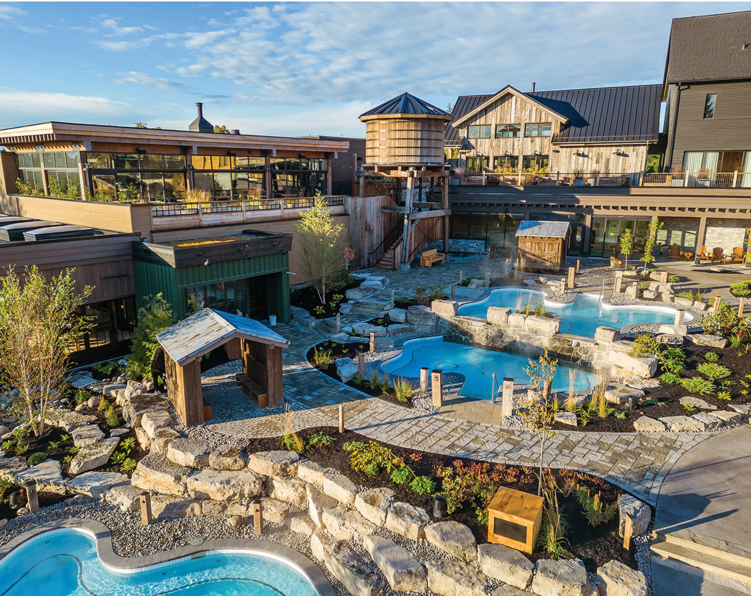
▲ Thermëa spa village, Whitby