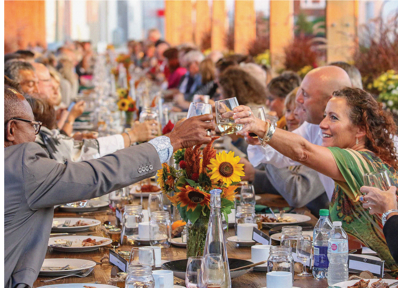
▲ Harvest Dinner at the W. Galen Weston Centre for Food, Whitby