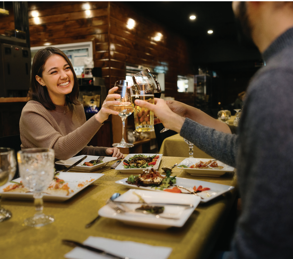
◀ Stefano's Bistro, Downtown Beaverton