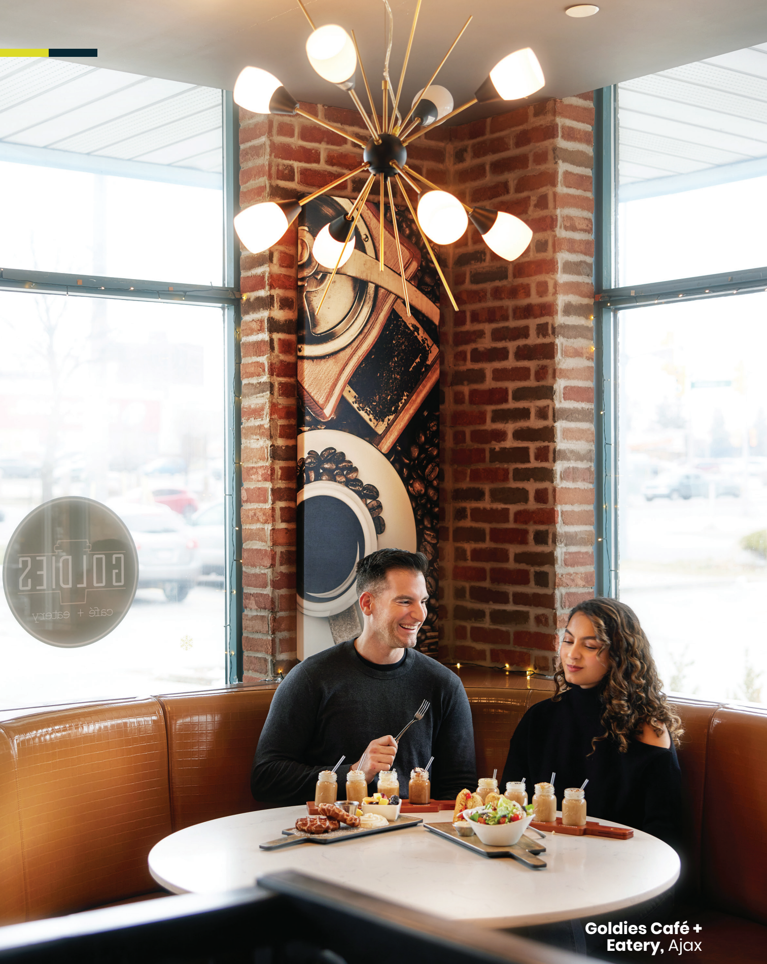
Goldies Café + Eatery, Ajax