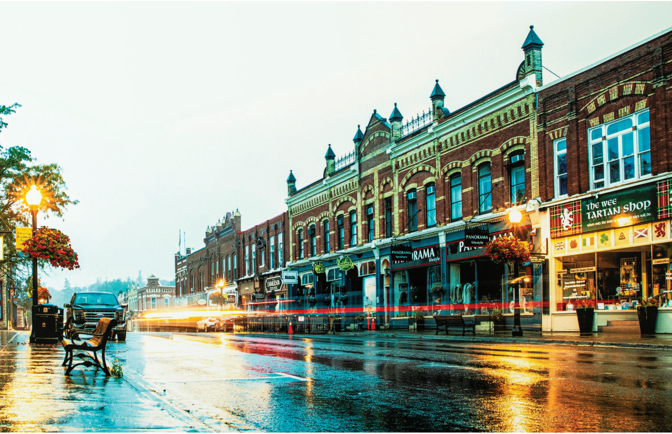
▲ Downtown Port Perry