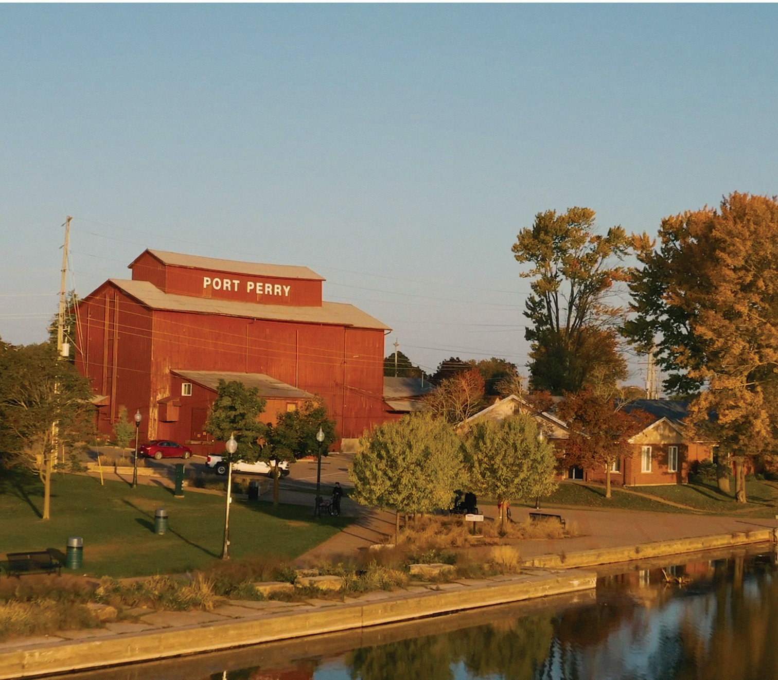
▲ Palmer Park on the shores of Lake Scugog, Downtown Port Perry