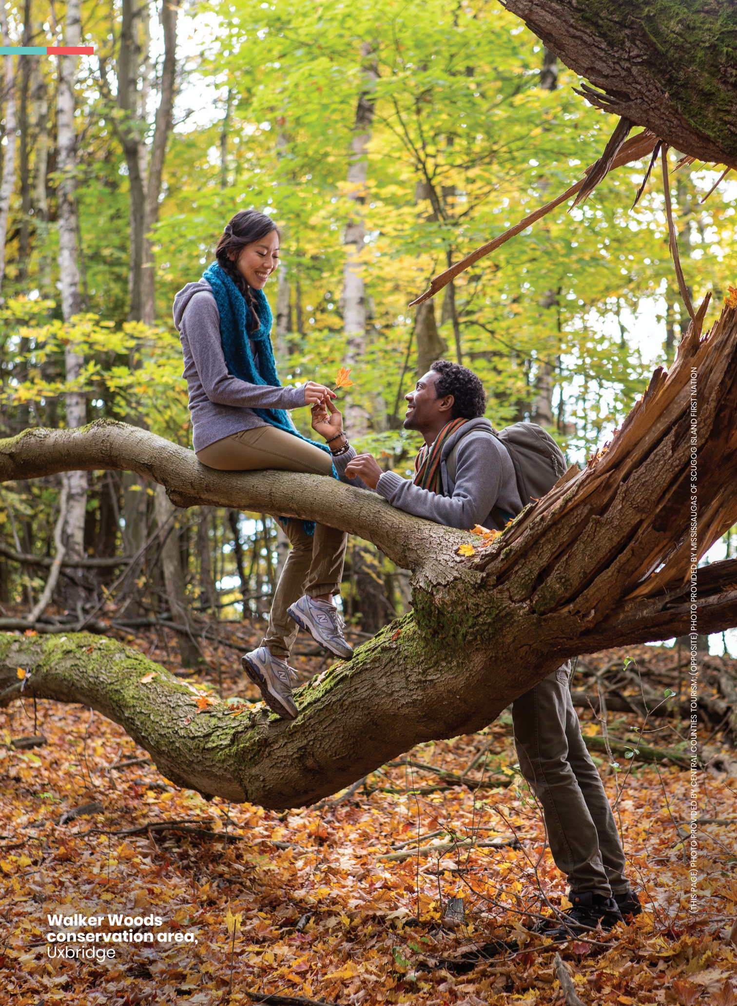
(THIS PAGE) PHOTO PROVIDED BY CENTRAL COUNTIES TOURISM; (OPPOSITE) PHOTO PROVIDED BY MISSISSAUGAS OF SCUGOG ISLAND FIRST NATION