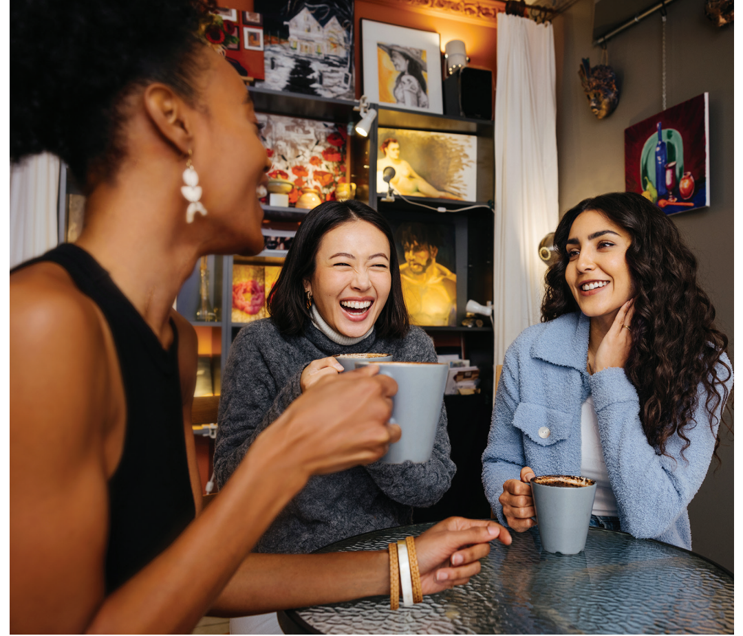
Open Studio Art Café, Pickering Nautical Village