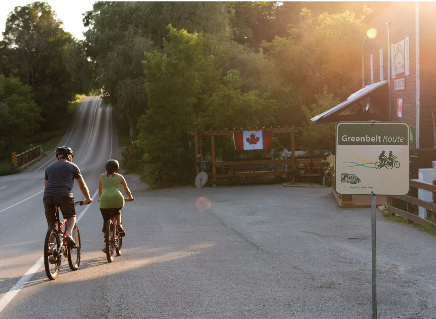
▲ Tyrone Mills, Bowmanville. Find them on 'A Country Path' in Clarington