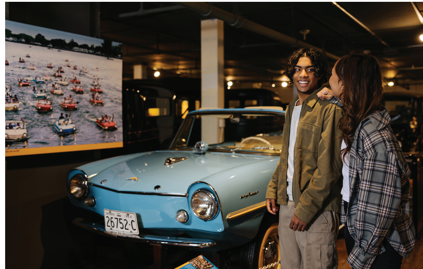
Canadian Automotive Museum, Oshawa