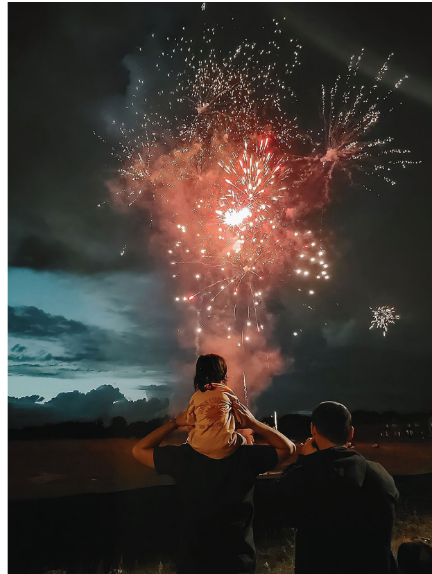
Victoria Fields Park, Whitby

(OPPOSITE) PHOTO PROVIDED BY YORK-DURHAM HERITAGE RAILWAY; (TOP) PHOTO PROVIDED BY @QUEENSCOMMONWEST ON INSTAGRAM