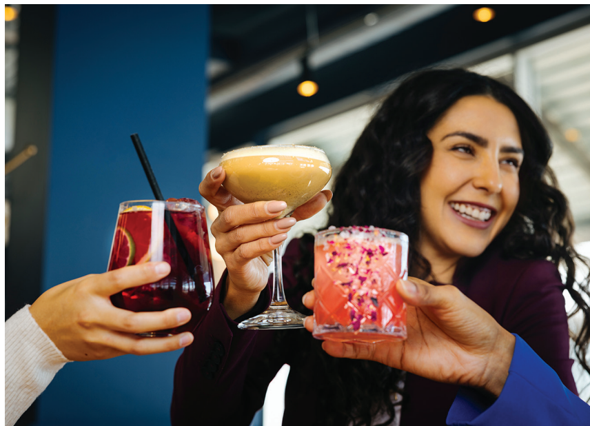
▶ Port Restaurant, Pickering

(OPPOSITE) PHOTO PROVIDED BY @CAPTUREDBYSAGE ON INSTAGRAM