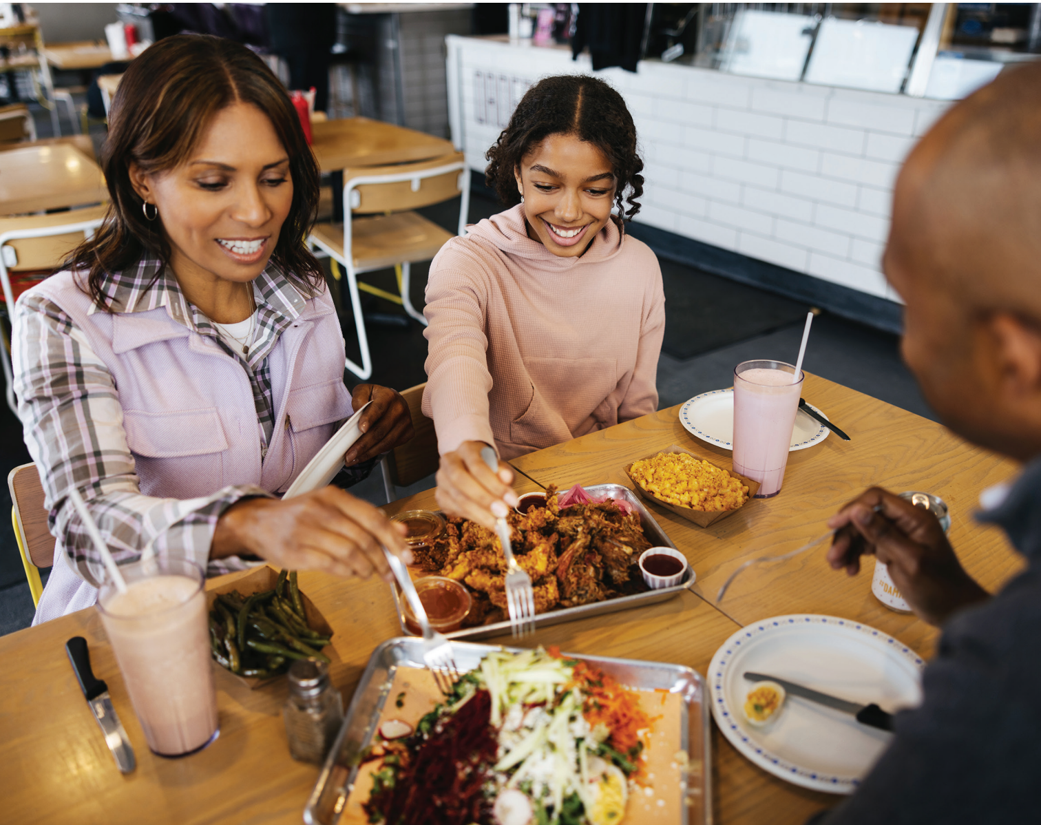
Butchie's, Whitby. Find more great places to eat in the Whitby Food Guide