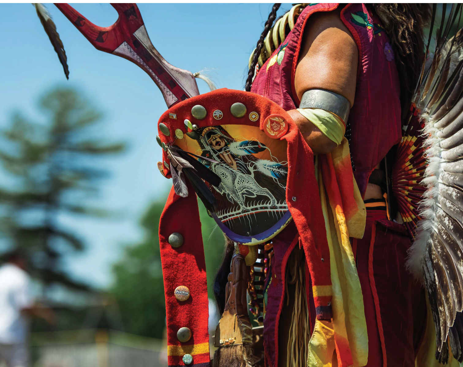
▲ Mississaugas of Scugog Island First Nation Pow Wow, Scugog Island