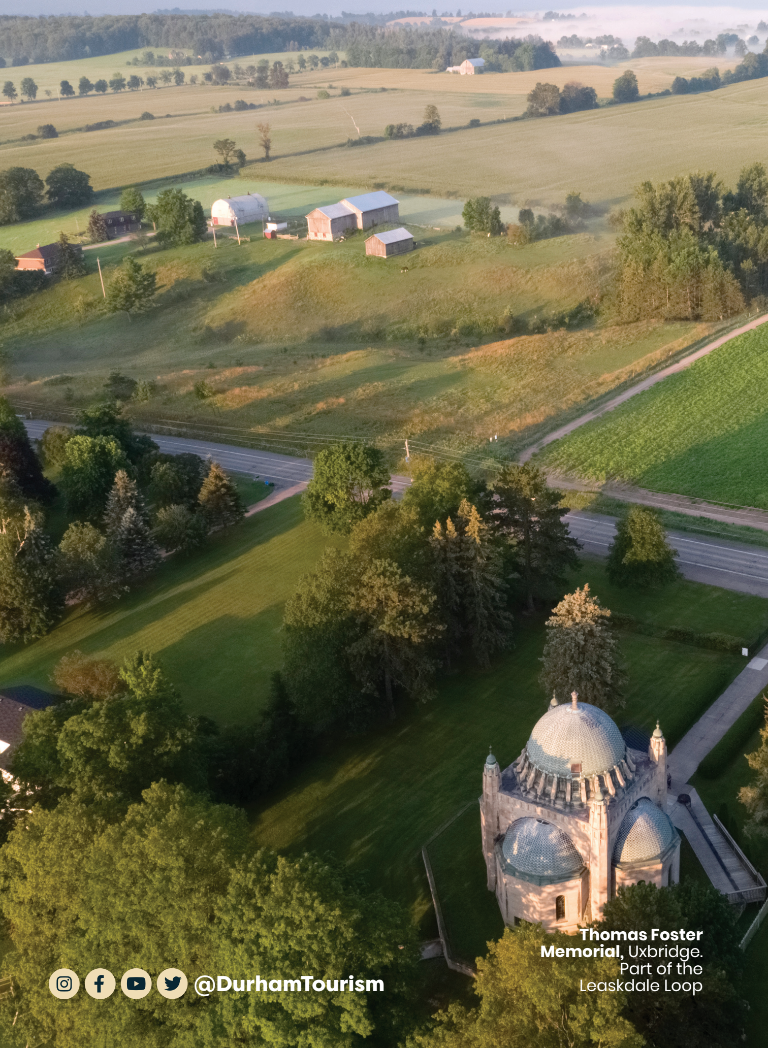
Thomas Foster Memorial , Uxbridge. Part of the Leaskdale Loop