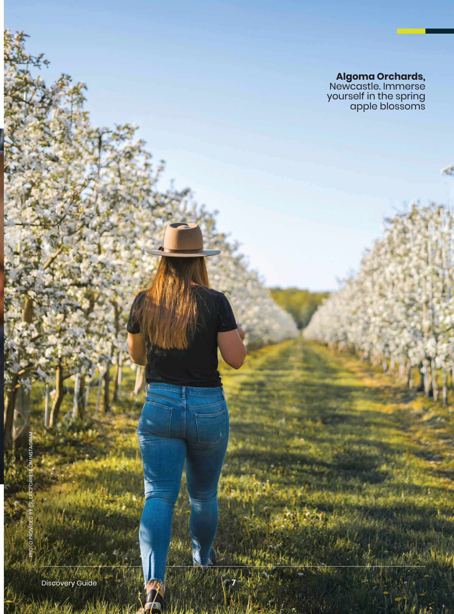
Algoma Orchards, Newcastle. Immerse yourself in the spring apple blossoms