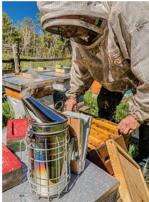
▶ Villa Vida Loca Market, Sunderland

Find both of these locations on the Backroads of Brock