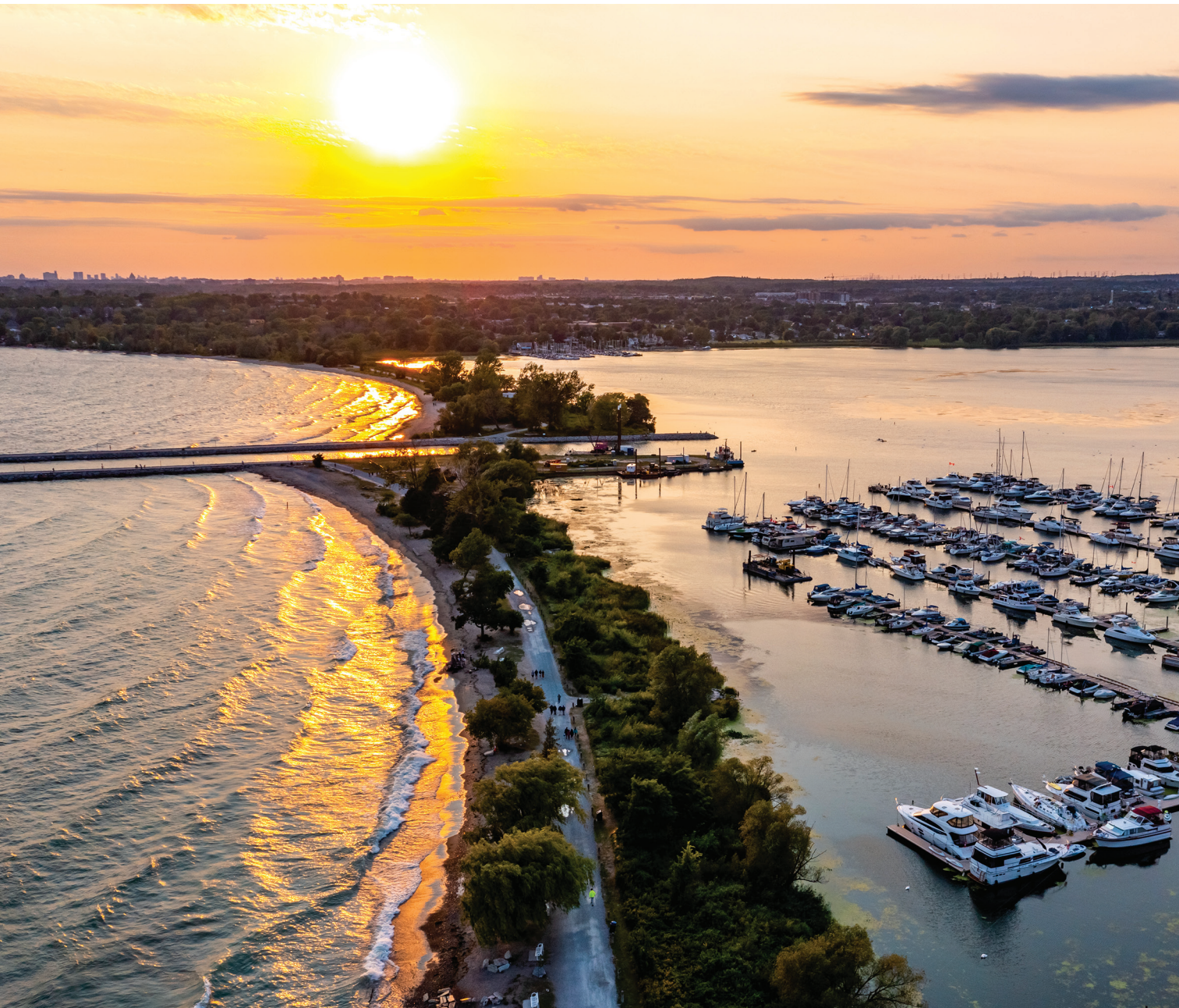
Frenchman's Bay, Pickering