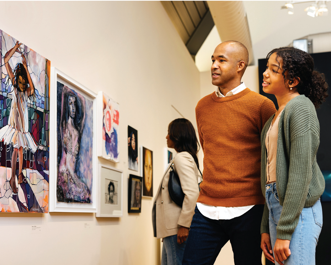
▲ Station Gallery, Whitby