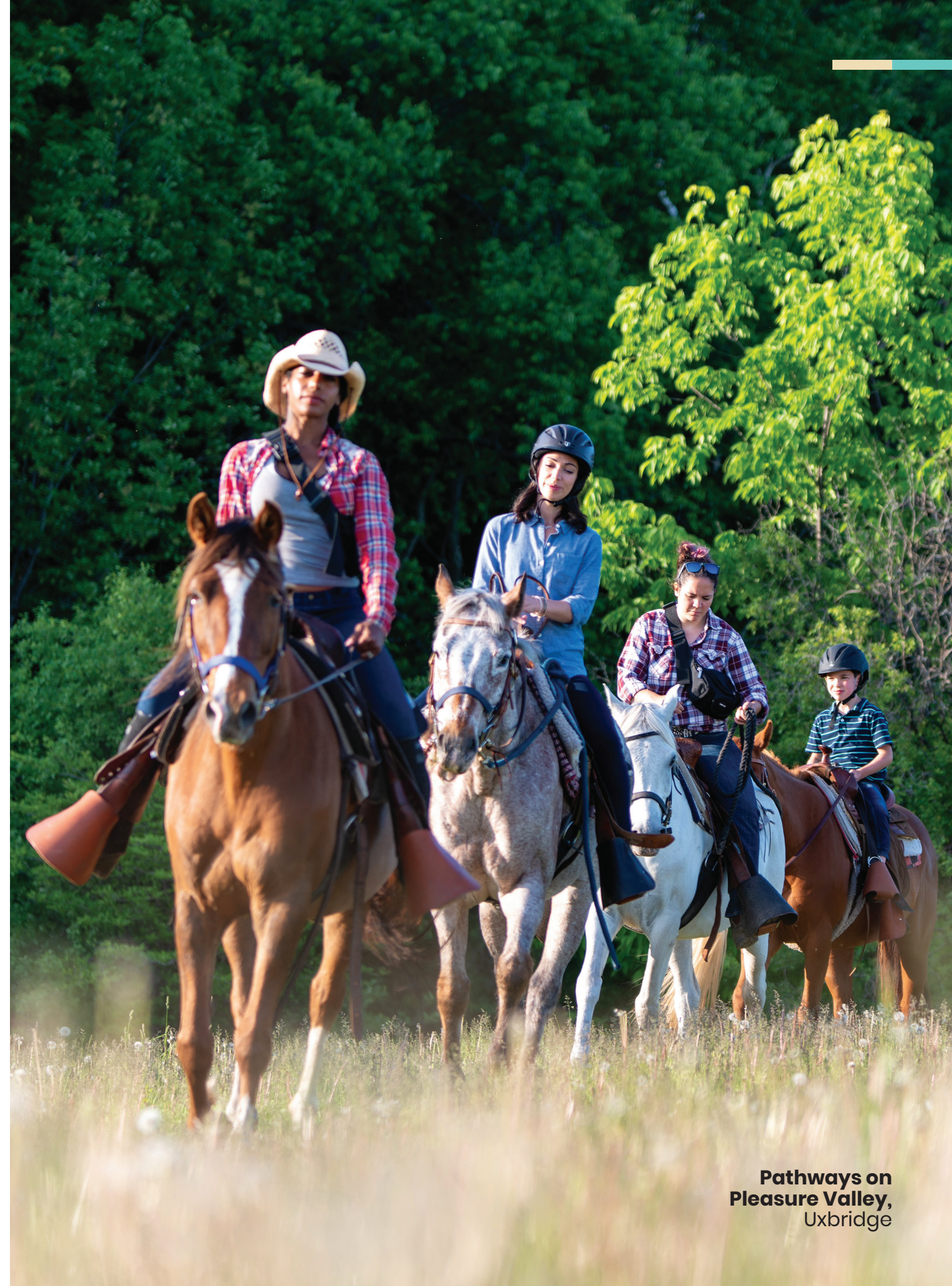
Pathways on Pleasure Valley, Uxbridge