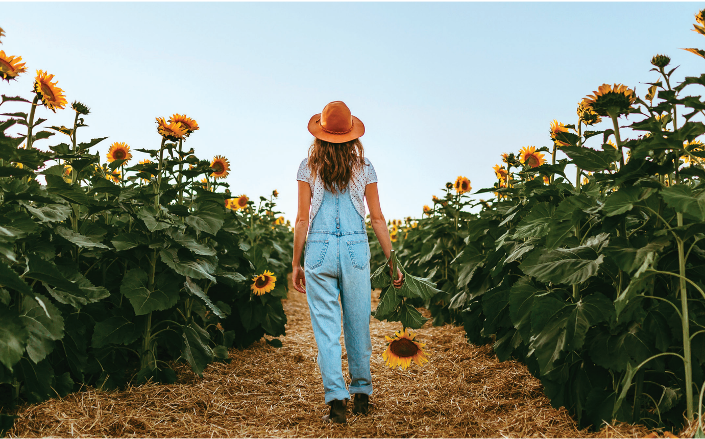
▲ The Sunflower Farm, Beaverton