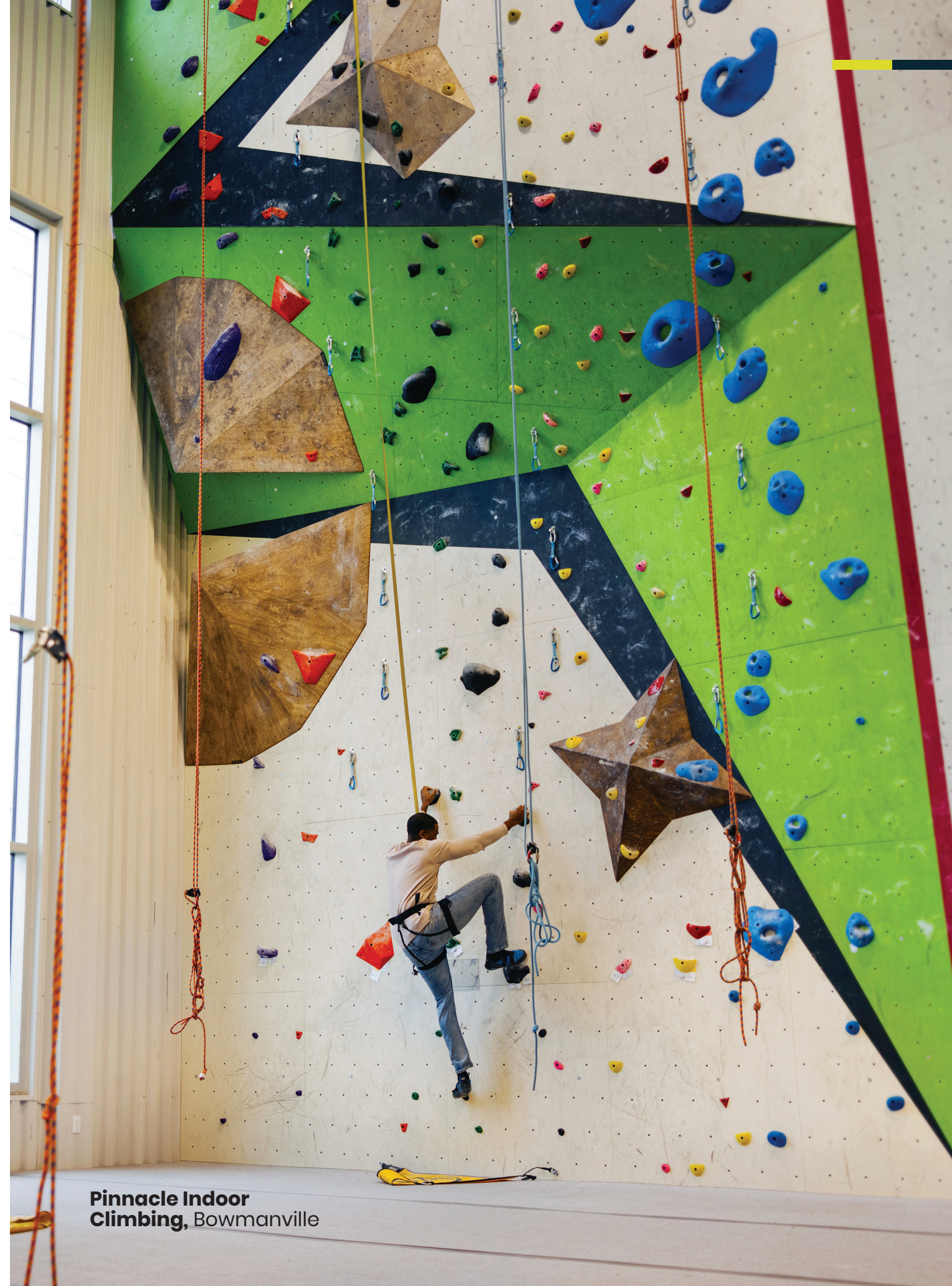
Pinnacle Indoor Climbing, Bowmanville